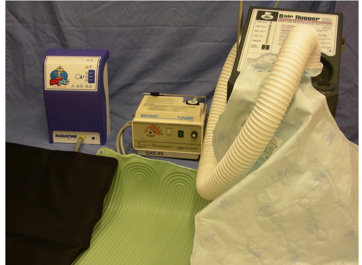
Fig. 1 Thermogenic devices

From left to right: Hot Dog™ patient warming system & conductive fabric pad, Gaymar® T/PUMP® Heat Therapy Pump Model TP-500 & water blanket, Bair Hugger® warming unit & model 55577 blanket.